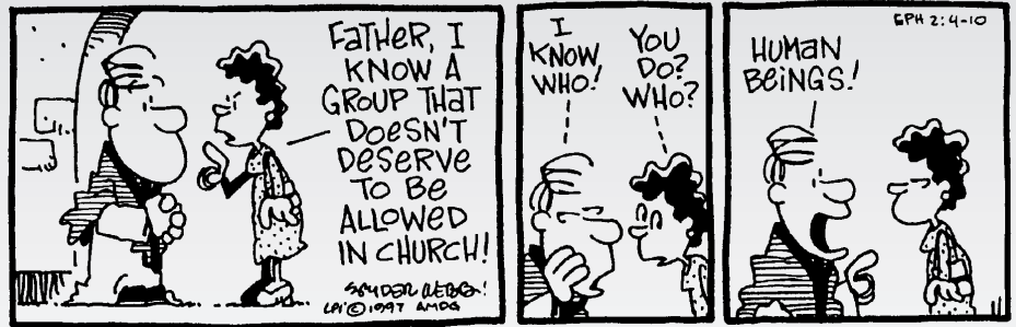
4 th SUNDAY OF LENT

If you have not done so, please browse our special Lenten readings. You will find baskets with reading materials ranging from daily prayer books to some outstanding books called Rediscover Catholicism or Rediscover Jesus . Take time to browse the materials and pick something out! Books are free, and we encourage you to pass them on to someone else after reading. Spend a little time every day preparing your mind and heart for Jesus during this Lenten season.