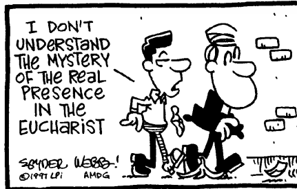
20th SUNDAY IN ORDINARY TIME