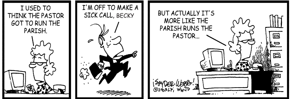
25th SUNDAY IN ORDINARY TIME

A meeting for the parents of the youth preparing for Confirmation is scheduled for Wednesday October 3rd at IC Parish Hall from 6:00-7:30pm. Confirmation class will also extend until 7:30pm on this night as well. Please note this is a change to what has been scheduled on the religious education calendar.