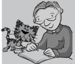
From Father's Desk