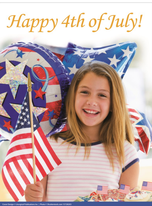
13 th SUNDAY IN ORDINARY TIME

It is time to start thinking about IC's picnic. We are going to try something different this year. We would like to have homemade items in our Country Store. If you are a wood worker, crafter, painter, wreath maker, crocheter, knitter, etc. can you please donate an item. If you do not fit into a category, we would ask you to please donate $5-$10 gift cards to any establishment you choose. Yard signs, advertising the picnic, are also available for $9 if you would like to help advertise. Raffle tickets should be turned in by July 13th by 6:30 pm.