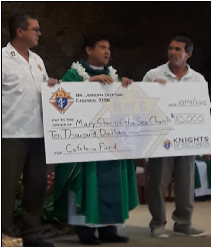
Thank you ever so much to the Knights of Columbus for their generous donation towards the MSOS cafeteria renovation.