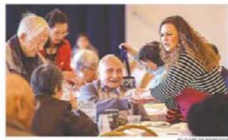
Fraternity and turkey. A group of children and adults are gathered around a table, enjoying a meal.

T his community sits with vast stretches of empty houses and empty streets. In the American city the size of Detroit has over endured such a prolonged structural decline of its housing stock. Because Detroit suffered an economic disaster rather than a natural one, federal programs under the Obama administration such as the ones deployed in New Orleans after Hurricane Katrina and in New York and New Jersey after Hurricane Sandy are not available. The city's solution for addressing how to restore a neighborhood is to create a "neighborhood" of property values are among the highest in the city. The city and business leaders are targeting "neighborhood" as a strategy to attract investment and create jobs.