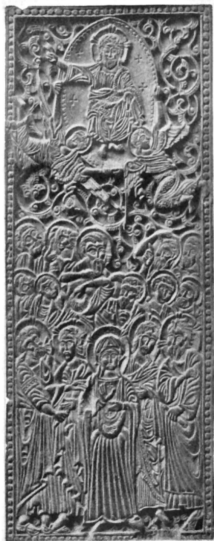
The Ascension of Christ, 15th century cedar panel from Egypt

"God permits evil, and brings good from it, but is not the source or cause of evil."