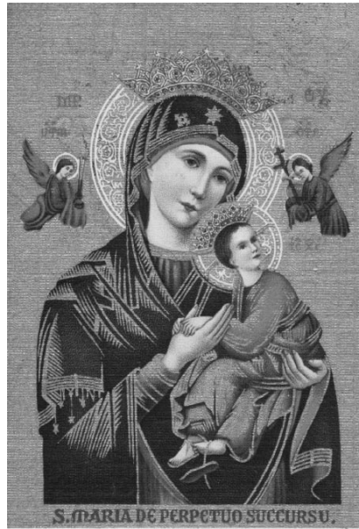
Icon of Our Lady of Perpetual Help

Though the error of Luther is over 500 years old and that of Pelagius 1500 years old, people today still fall into them. Present-day rationalists essentially have picked up the Pelagian error that we do not need God's grace but can reach perfection through our own means. Luther's doctrine of the irreformable corruption of human nature was picked up by a Catholic bishop in France named Cornelius Jansenius. Although Jansenius died in communion with