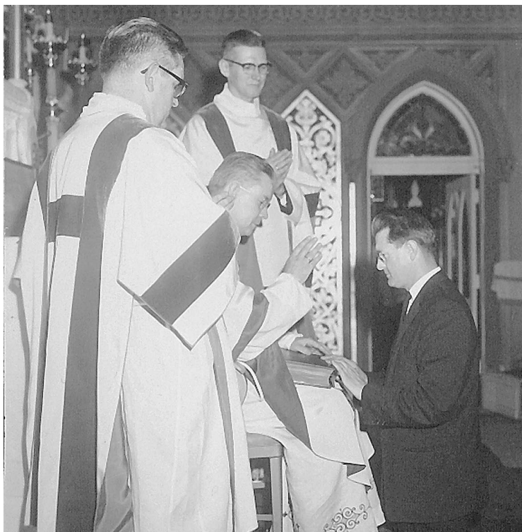
Answering an inner call from God: a man takes vows to enter religious life as a brother

"The obligation to follow the certain judgment of conscience is binding."