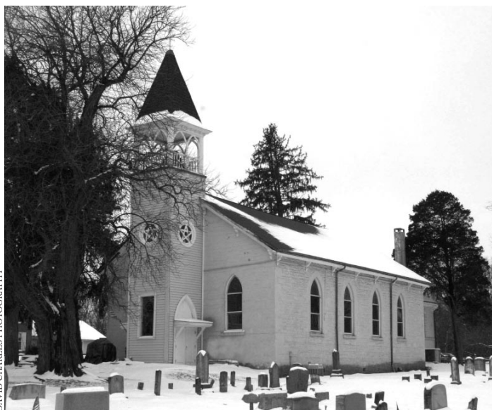
Chapel of Sacred Heart Church in Bowie, Maryland, built in 1741

God created the sabbath for us, his human creatures. We are created with a need to worship him and, physically and spiritually, we need rest and lei-