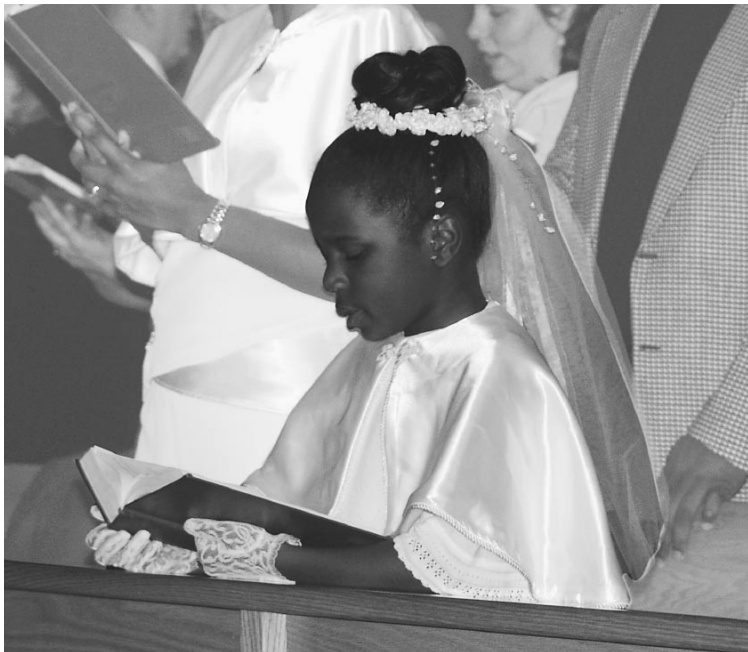
A child singing during the Easter Vigil Mass in which she and her mother were baptized

"if Christ has not been raised, then our preaching is in vain and your faith is in vain" (1 Cor 15:14). This day, therefore, is a "new creation," more important than the day of creation itself: "The first creation finds its meaning and its summit in the new creation in Christ, the splendor of which surpasses that of the first creation" 1 (CCC 349). Sunday is often