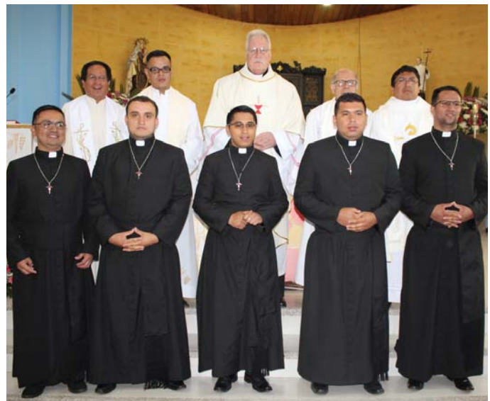
Seminarians gather at a mass in Colombia.

We're working with lay volunteers who cook lunch several times a week in a simple kitchen behind Our Lady of Carmel Chapel. They serve a hot, nutritious lunch to the dozens of young children who come from miles around. Malnutrition is a real problem in Guatemala; volunteers track the children's weight to be sure the project is helping—and it is!