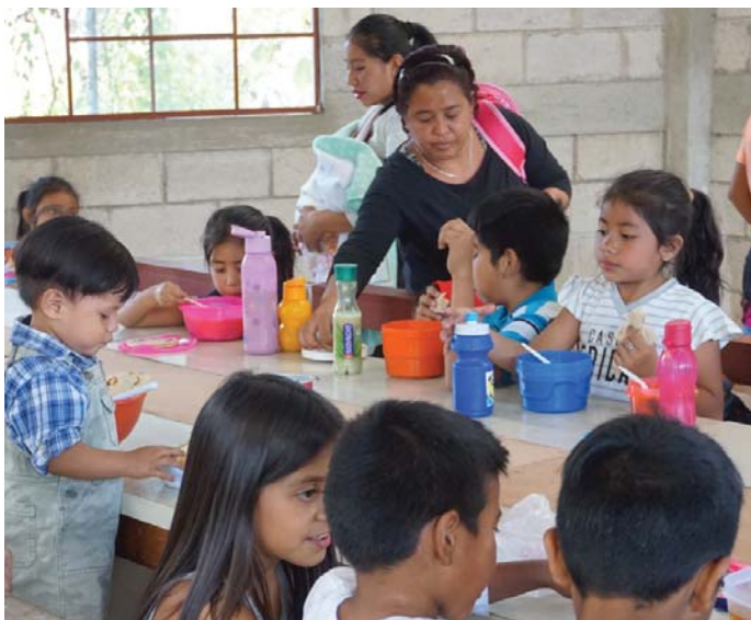
Lunch is served at the nutrition project in Guatemala.

One example is the Missionaries' nutrition project in the La Labor region of Guatemala.