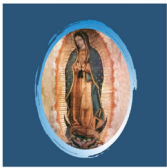
HELP BUILD A CIVILIZATION OF LOVE 2019 Bishop's Annual Appeal

This is a very special event conducted by good folks from our Diocese with the Sacrament of reconciliation available as well. Come take a break from life's cares and spend a little time with Mary in prayer at Benediction and the Awakening Evening liturgy. Let her help you light your heart on fire with love for her Son.