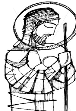
Prayer to Saint Joseph

To you, O blessed Joseph, do we come in our tribulation, and having implored the help of your most holy Spouse, we confidently invoke your patronage also.