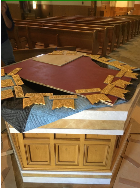
The panels hand-carved in Vietnam and gold leafed Stateside to coordinate with the Sanctuary await their installation