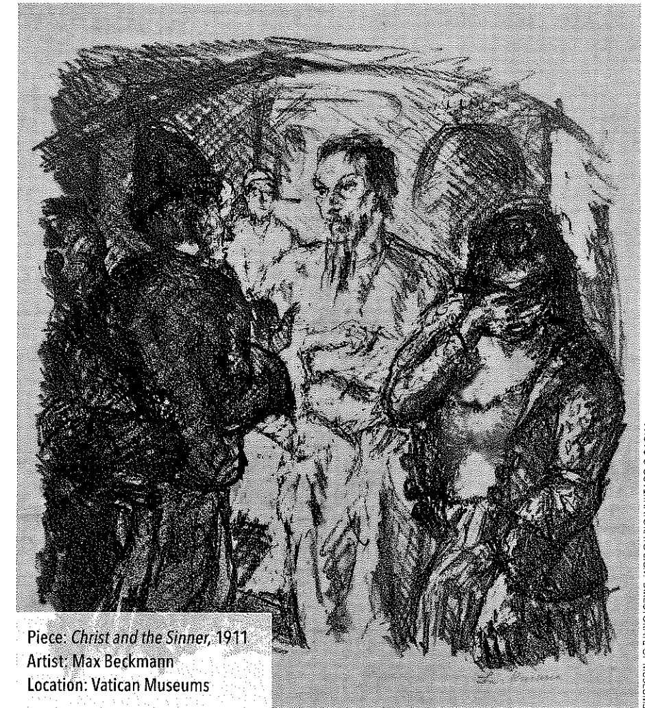
Piece: Christ and the Sinner , 1911 Artist: Max Beckmann Location: Vatican Museums