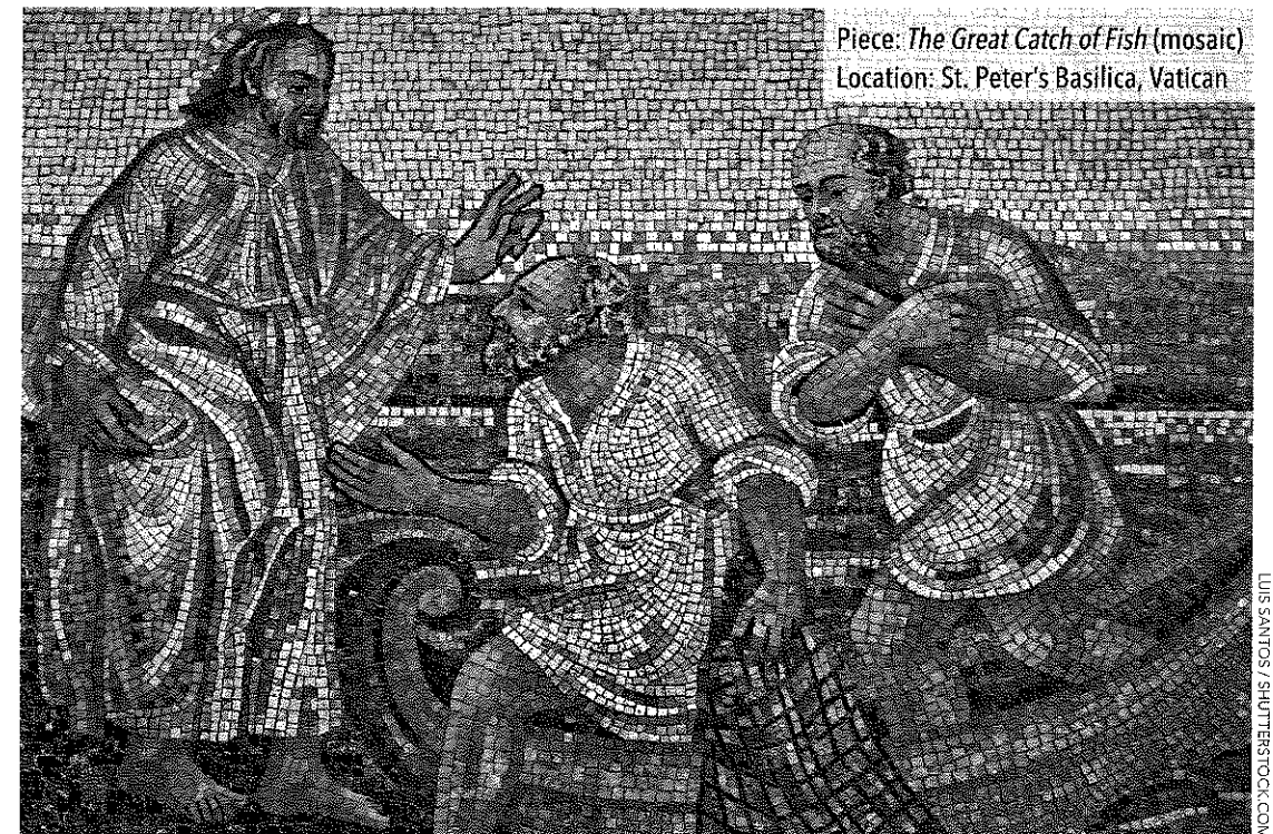
Piece: The Great Catch of Fish (mosaic) Location: St. Peter's Basilica, Vatican

Is there a way I need to release someone else by forgiving him or her?