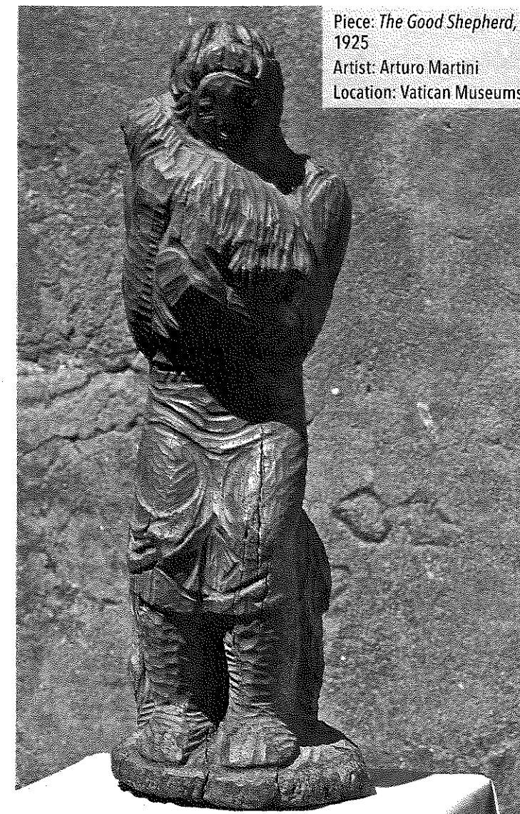
Piece: The Good Shepherd , 1925 Artist: Arturo Martini Location: Vatican Museums