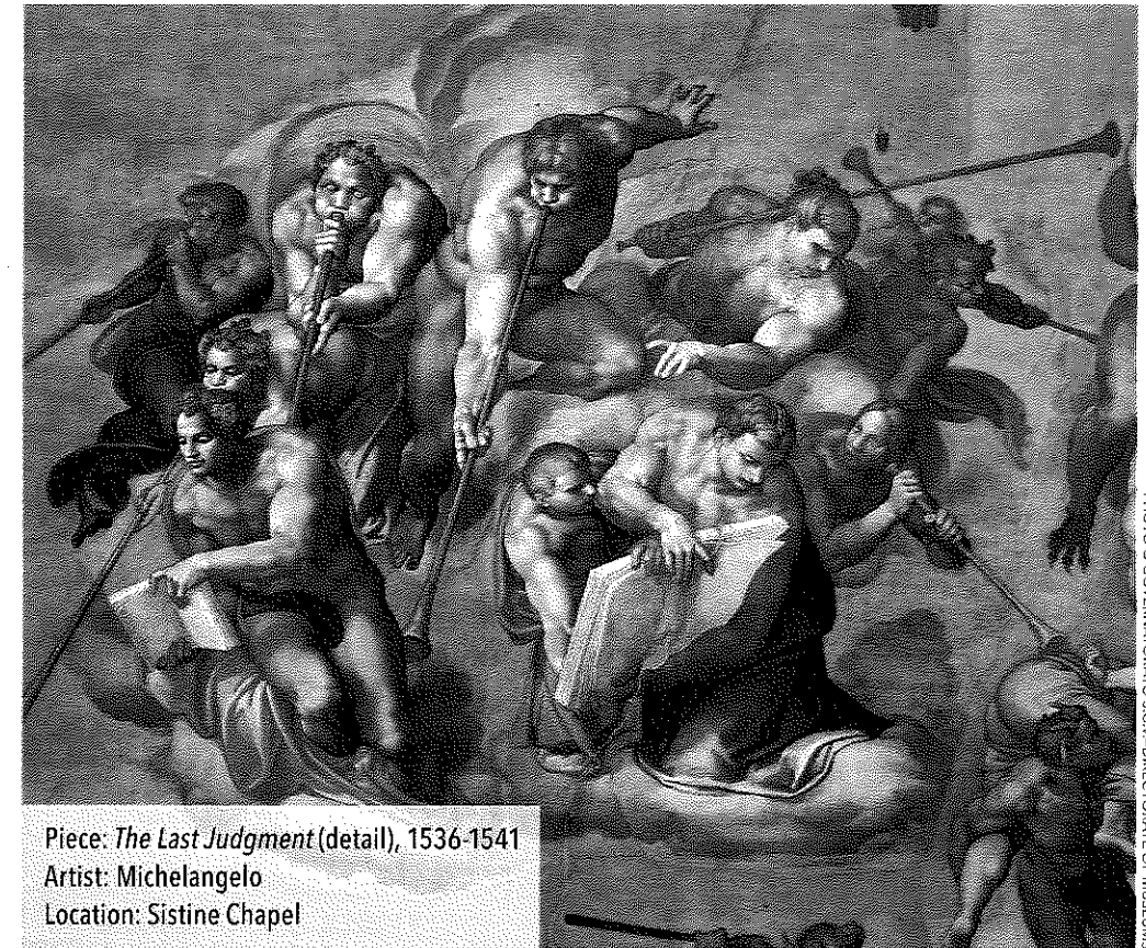
Piece: The Last Judgment (detail), 1536-1541 Artist: Michelangelo Location: Sistine Chapel

The glory of this kingdom isn't in church buildings or organizations, but it's the glory that Jesus mentions in today's Gospel. "Now is the Son of Man glorified, and God is glorified in him" (John 13:31). It's the glory that comes from Jesus' faithful love toward the Father and his disciples, leading him to be enthroned on the cross and rule as the Lamb that was slain yet still