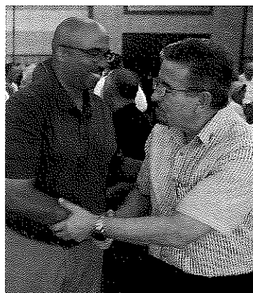
CATHOLIC CONVOCATION, ORLANDO