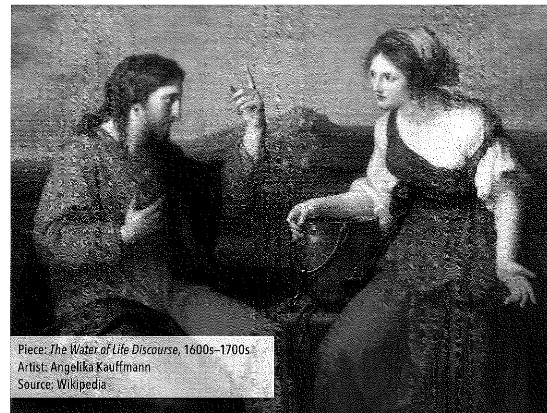
Piece: The Water of Life Discourse , 1600s–1700s