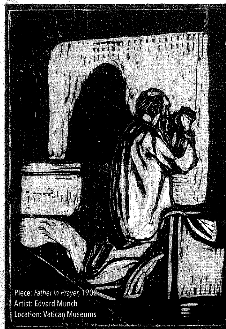
Piece: Father in Prayer, 1902 Artist: Edvard Munch Location: Vatican Museums