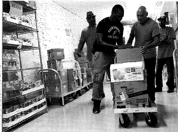
Volunteers organize stock for a distribution hub that helps supply fresh produce and nutritious food to pantries and soup kitchens in underserved areas.

The money you give runs your parish and provides assistance to the poor, both locally and throughout your diocese. Scripture mentions the disciples offering money to meet the needs of the poor. The Catechism of the Catholic Church states: "The faithful also have the duty of providing for the