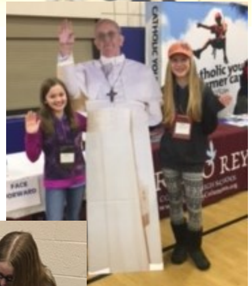
Above — posing with the POPE!