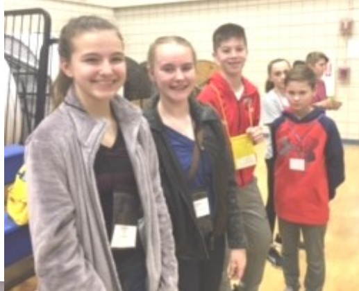
Right— waiting in line to play a game.