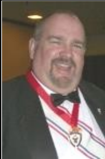
Grand Knight and District Deputy 23