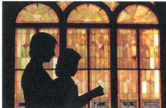
God + Couple = Relationship The Power of Three