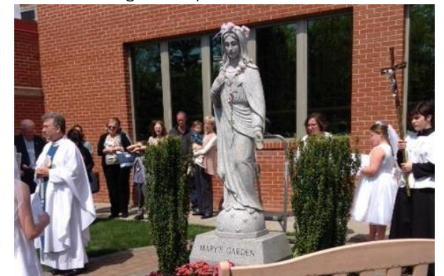
May Crowning 2017

7. PROGRAMS - Arranges for speakers and events.