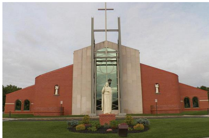
Caring for the Lord's House

In our parish, the Confraternity of the Most Holy Rosary was established under the name of Rosary Altar Society of St. Pius X.