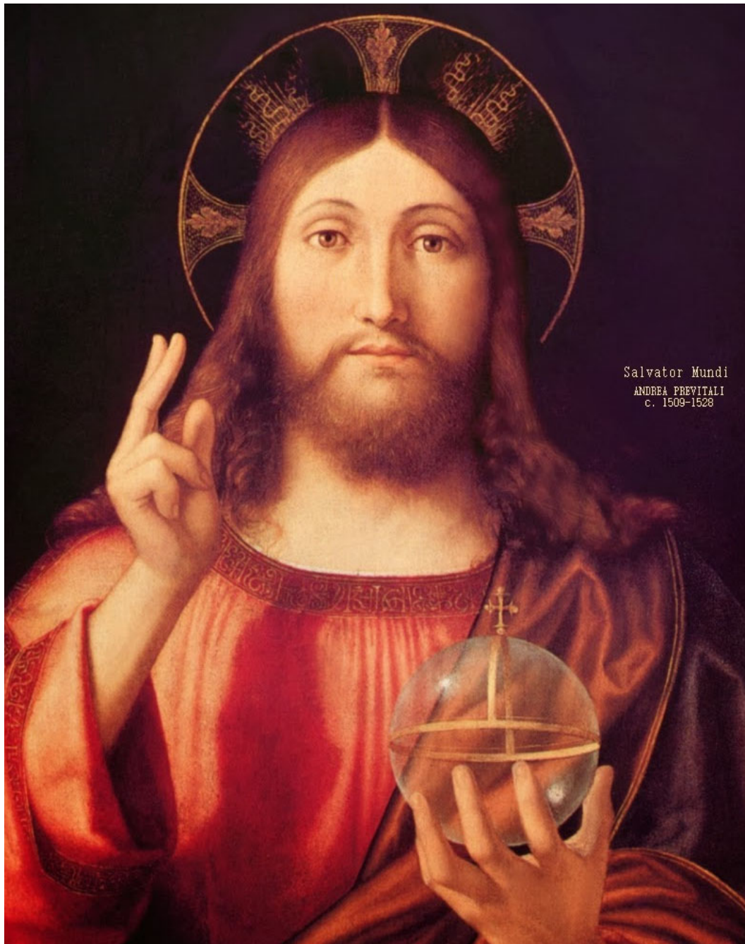
Salvator Mundi ANDREA PREVITALI c. 1509-1528