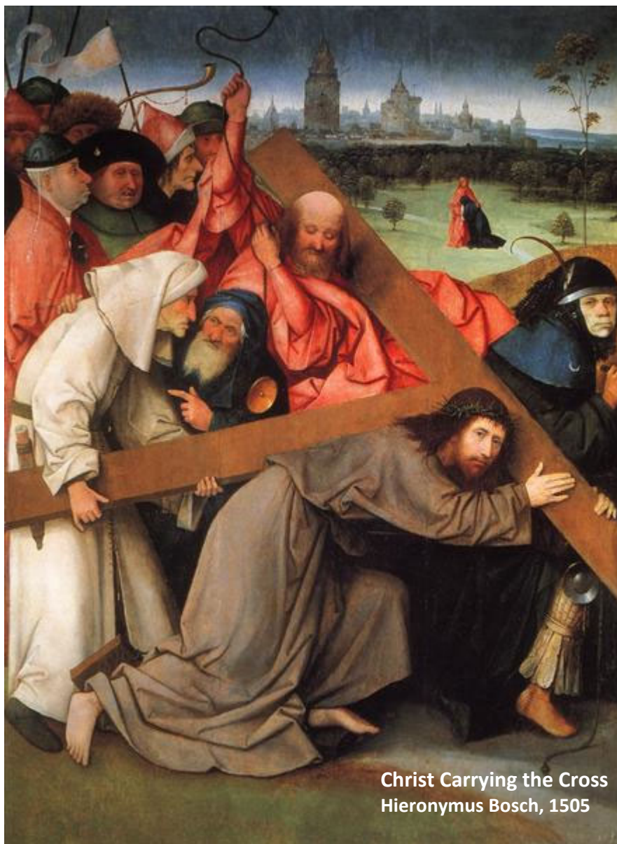
Christ Carrying the Cross Hieronymus Bosch, 1505