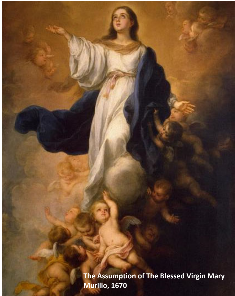
The Assumption of The Blessed Virgin Mary Murillo, 1670