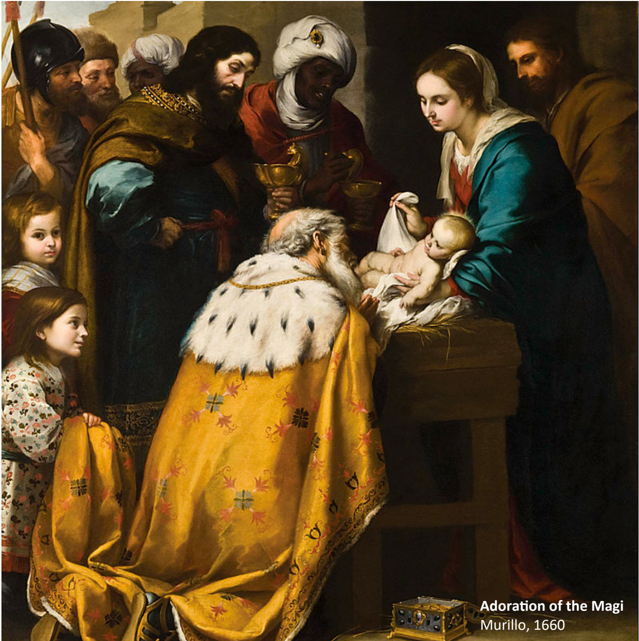
Adoration of the Magi Murillo, 1660