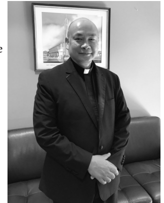
Mary, Health of the Sick. Pray for us.

of Hope. On February 11, Feast of the Our Lady of Lourdes, and also the World Day of the Sick, we will be offering Masses for Healing. Masses are scheduled at 8:00 AM and 11:00 AM in English, and 6:30 PM in Spanish. Let us persevere in prayer, with faith and hope in our hearts. We are grateful that the COVID 19 vaccines are available. I hope and pray that all of us will be vaccinated. There is nothing to fear about this vaccine. An official statement released by the archdiocese "encourages Catholics to receive a safe and effective COVID -19 vaccine for the sake of ourselves, our loved ones, and the common good. If some of the faithful choose not to take the vaccine for reasons of conscience, the Vatican says those persons "must do their utmost to avoid becoming vehicles for the transmission of the infectious agent. Otherwise, we are strongly encouraged to receive the vaccine when able, so as to ensure the health and safety of our parish communities.