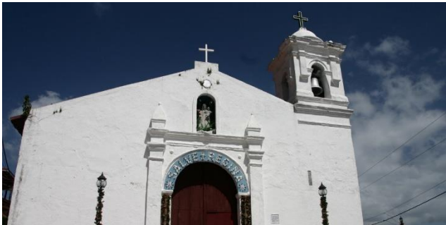
Iglesia San Pedro, the second oldest church in the entire Western Hemisphere

Paul Gauguin, a famous post-impressionist painter, also lived on the island for a little time around 1887. He was influenced by the flowers and bright colors which inspired his later work. He was there because he worked a little on the Panama Canal when the French had attempted to build it and failed.