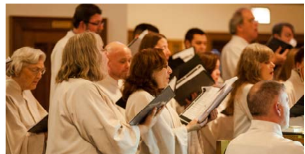
The Saint Monica Parish Choir, Lessons & Carols 2015

The Saint Monica Parish Choir will conclude the 2015-2016 Choral Season on Sunday, 29 May, the Solemnity of the Most Holy Body and Blood of Christ (Corpus Christi), at the 9:30 a.m. Mass. Please join me in thanking the talented volunteer musicians of our parish for their dedication and many, many hours of service throughout the year. The cantors of the parish will continue to lead our sacred music throughout the summer months while the choir enjoys a much deserved break!