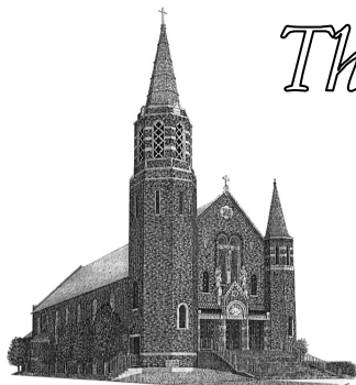
St. Mary, Hague