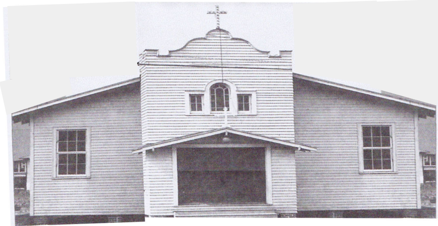
St. James Major Church 1928-35