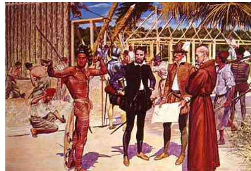
Thanksgiving-St. Augustine, Florida-1565