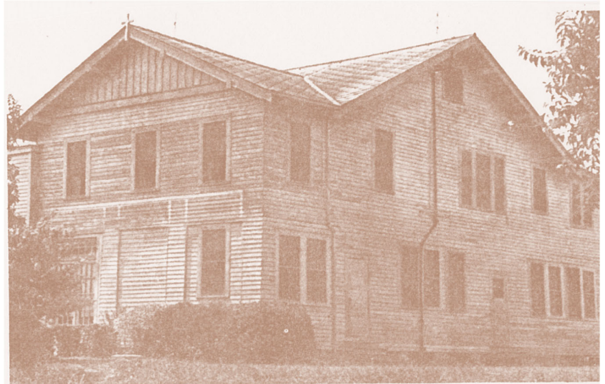
Church, School & Rectory 1920-28