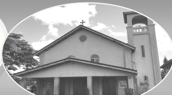
St. Michael Church - Est. 1853 St. Michael School - Est. 1944