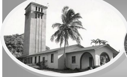
Sts. Peter and Paul Mission Est. 1953