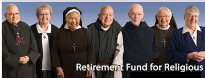
Retirement Fund for Religious