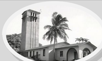
Sts. Peter and Paul Mission Est. 1953