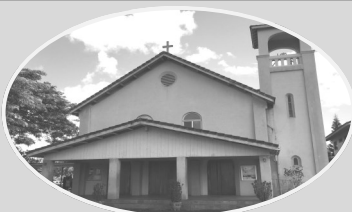
St. Michael Church Est. 1853 St. Michael School Est. 1944

SEPTEMBER 28 & 29, 2019 26TH SUNDAY IN ORDINARY TIME