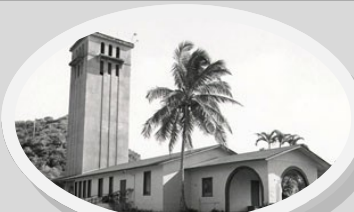
Sts. Peter and Paul Mission Est. 1953