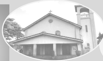
St. Michael Church Est. 1853

St. Michael Catholic Parish Prayer . Service . Generosity