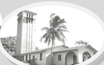
Sts. Peter and Paul Mission Est. 1953