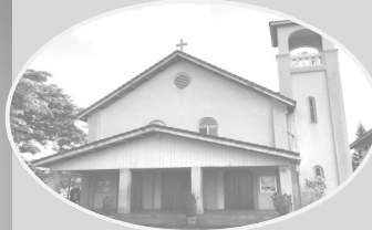
St. Michael Church Est. 1853

St. Michael Catholic Parish Prayer . Service . Generosity