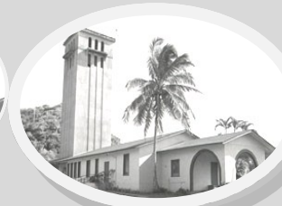
Sts. Peter and Paul Mission Est. 1953