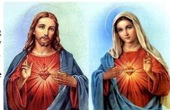
Sacred Heart of Jesus Immaculate Heart of Mary

Recognizing the birthday celebrants and wedding anniversaries.