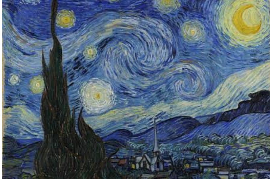
STARRY NIGHT BY VINCENT VAN GOGH