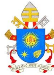
Pope Francis Vatican City State

Sacrament of Reconciliation Saturday: 4:30-5:30 p.m. Wednesday 6:00-6:30 p.m. First Friday: 4:00-5:30 p.m.