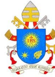
Pope Francis Vatican City State