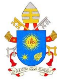
Pope Francis Vatican City State

Sacrament of Reconciliation Tuesday-Friday 6:00-7:00 p.m.