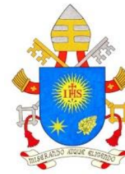
Pope Francis Vatican City State